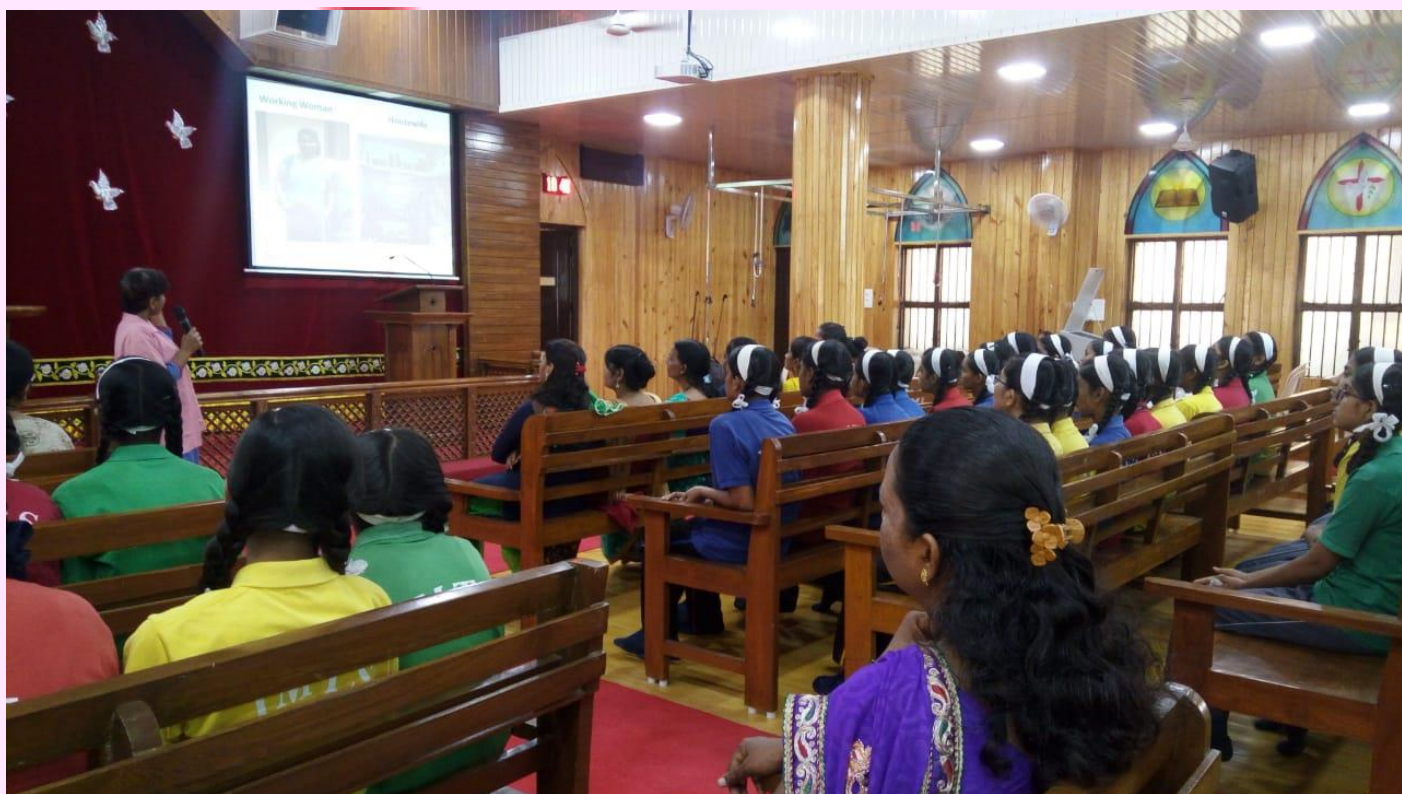
iii) Anand Park